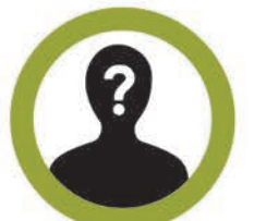
To Be Announced STAY TUNED! WORKSHOP INSTRUCTOR

MIDVALE PERFORMING ARTS CENTER 695 W CENTER ST. MIDVALE, UT 84047