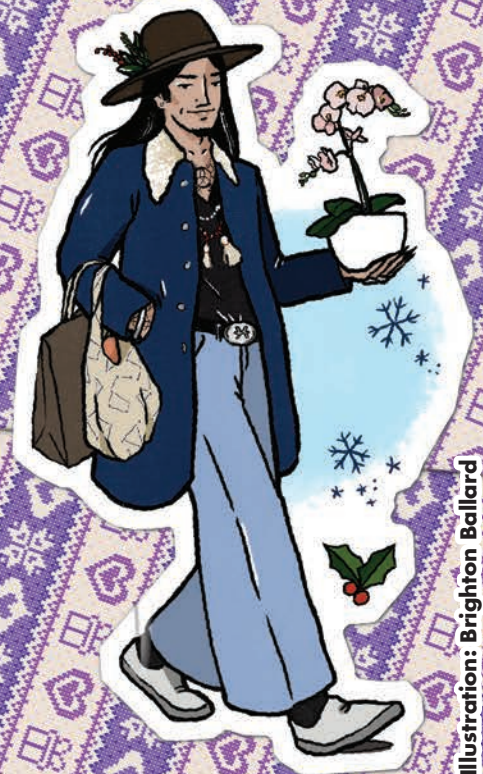
Illustration: Brighton Ballard

You certainly wouldn't know it at first glance, but Salt Lake City holds a litany of gifts for your local witch and healer. Sacred symbols and sweet reprieves can be found right here in the valley with bubbles, botany and mystic baubles aplenty waiting for their next worthy owner. Come in closer, pull back the curtain and find three local harbors outfitted with any gifts you may need to celebrate the inauguration of winter with those who have you spellbound.