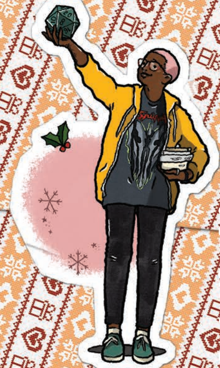
Illustration: Brighton Ballard

In a city ravaged by frigid tundra, the inevitable holiday festivities have come creeping in to take control once again. Through these trying times, a hero must rise to purchase the greatest nerd paraphernalia for the geekiest of their friends and family! Vanquish the Amazon overlords and shop locally this season at some of SLC's best gamer hotspots. If you're in the market for trading cards, comic books or tabletop gaming gear, these mythical emporiums come bearing gifts. Adventure awaits!