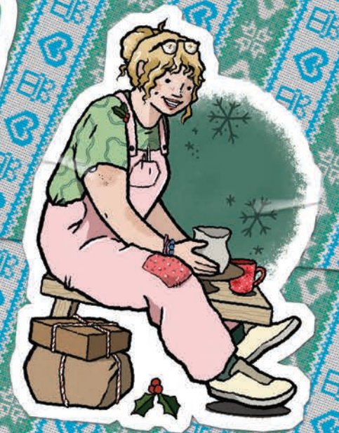
Illustration: Brighton Ballard

Holiday season is upon us and you find yourself nervously sweating the anticipation of finding a suitable present for the crafty artist in your life who is a frustratingly thoughtful gift giver. What could you possibly gift the person who hand-makes everything they need? Luckily, SLUG has rounded up a number of local spots that are sure to impress your local creative. From ceramic workshops to cutesy trinkets or hot drink blends that allow them to pull all-nighters, SLC is stocked with artistic goodies aplenty.